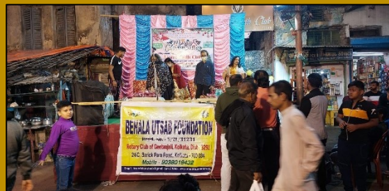
Behala Utsab Foundation, Distributing pre-Christmas gifts and food to children of Red-light area on 23 Dec.