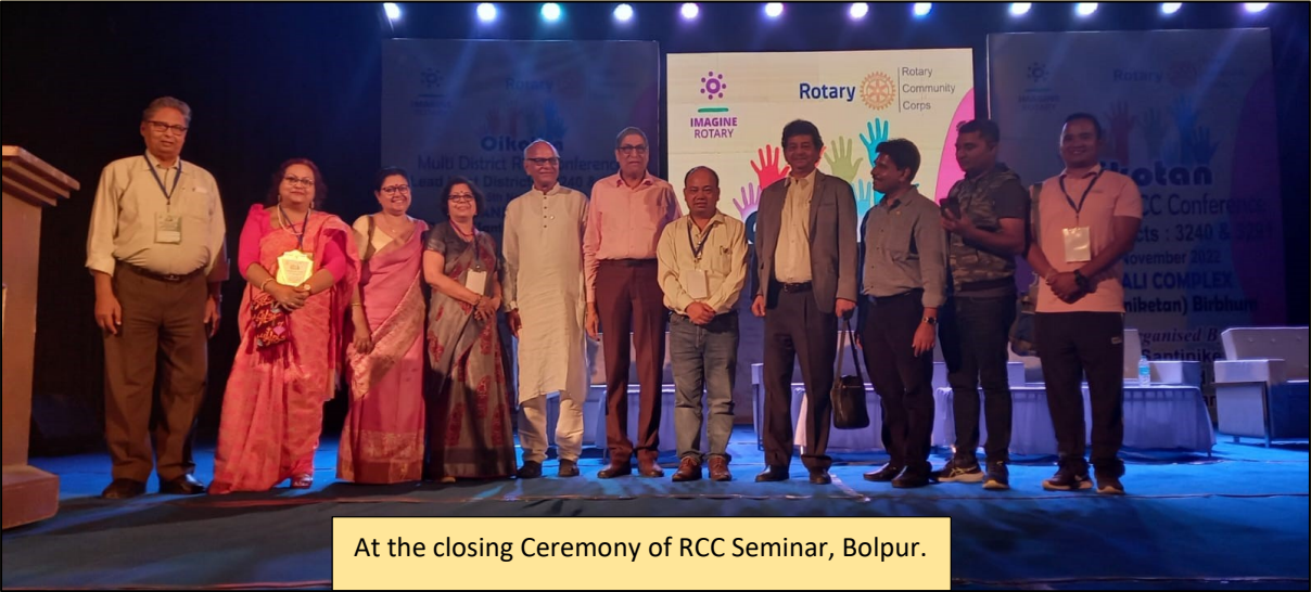
At the closing Ceremony of RCC Seminar, Bolpur.

“The secret of health for both mind and body is not to mourn for the past, not to worry about the future or anticipate troubles, but to live the present moment wisely and earnestly.” Buddha