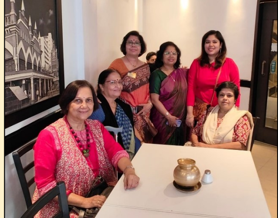
A most enjoyable Fellowship Lunch with 8 enthusiastic members. Delicious food with lots of adda & laughter!