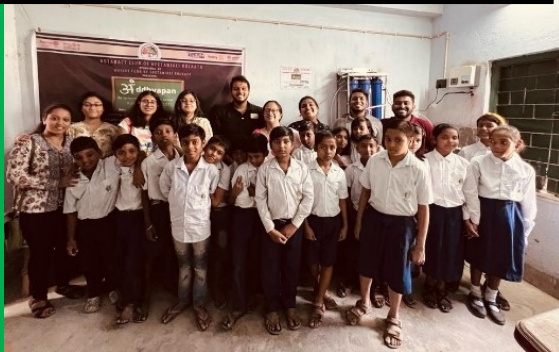
26 Nov: Adhyapan Phase - 4