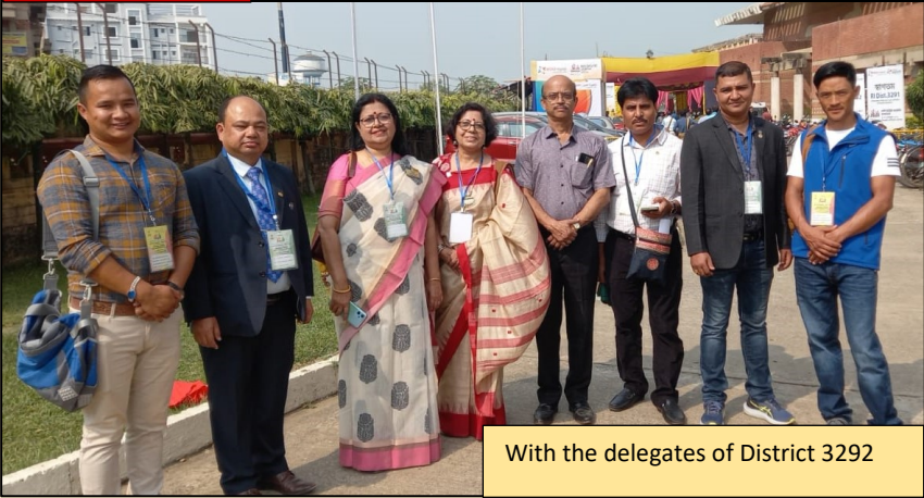
With the delegates of District 3292