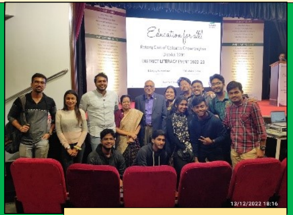
13 Dec: Education for All: Rotary Sadan