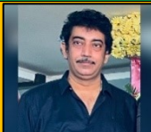
Rtn Sourav Ganguly 28 December