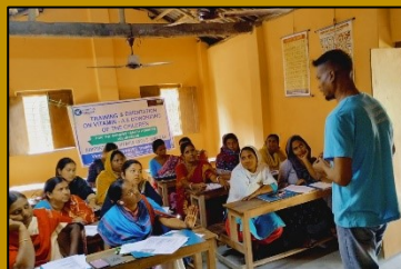
The BVNews conducting a Training & Orientation program with Health Workers at Basirhat on 3 Dec